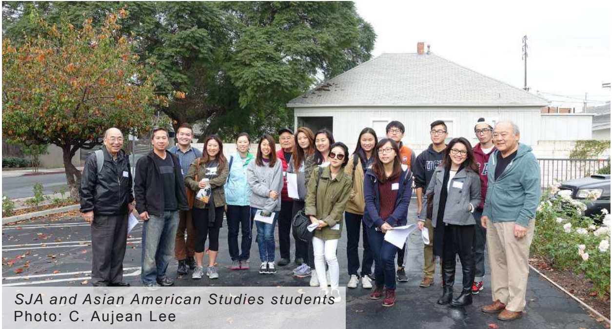
SJA and Asian American Studies students