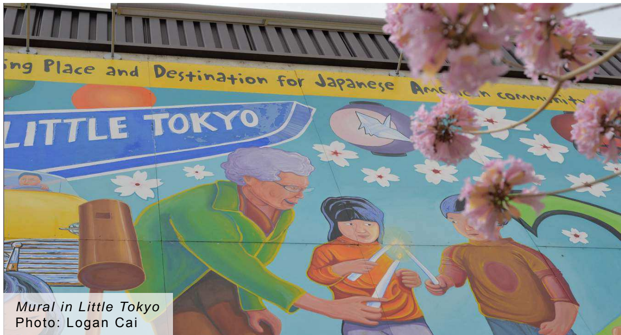
Mural in Little Tokyo