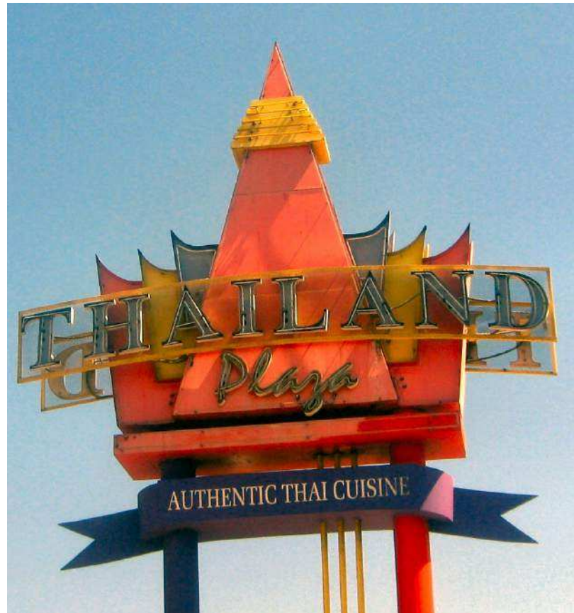
Thai Town commercial plaza

Another recommendation that can promote tourism is for SJA to create a brochure and other marketing materials. A brochure can include a brief history of Sawtelle, its landmark buildings, SJA's mission statement, and a map. If applicable, SJA can also include information on how to donate to SJA and its preservation efforts. Other marketing materials can include a website that has posts about the history of the area, businesses, events, press releases, SJA contact information, and a calendar of events.