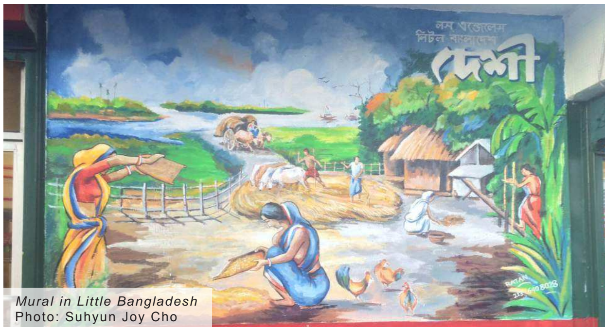
Mural in Little Bangladesh