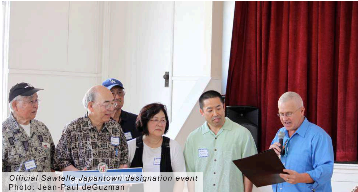
Official Sawtelle Japantown designation event