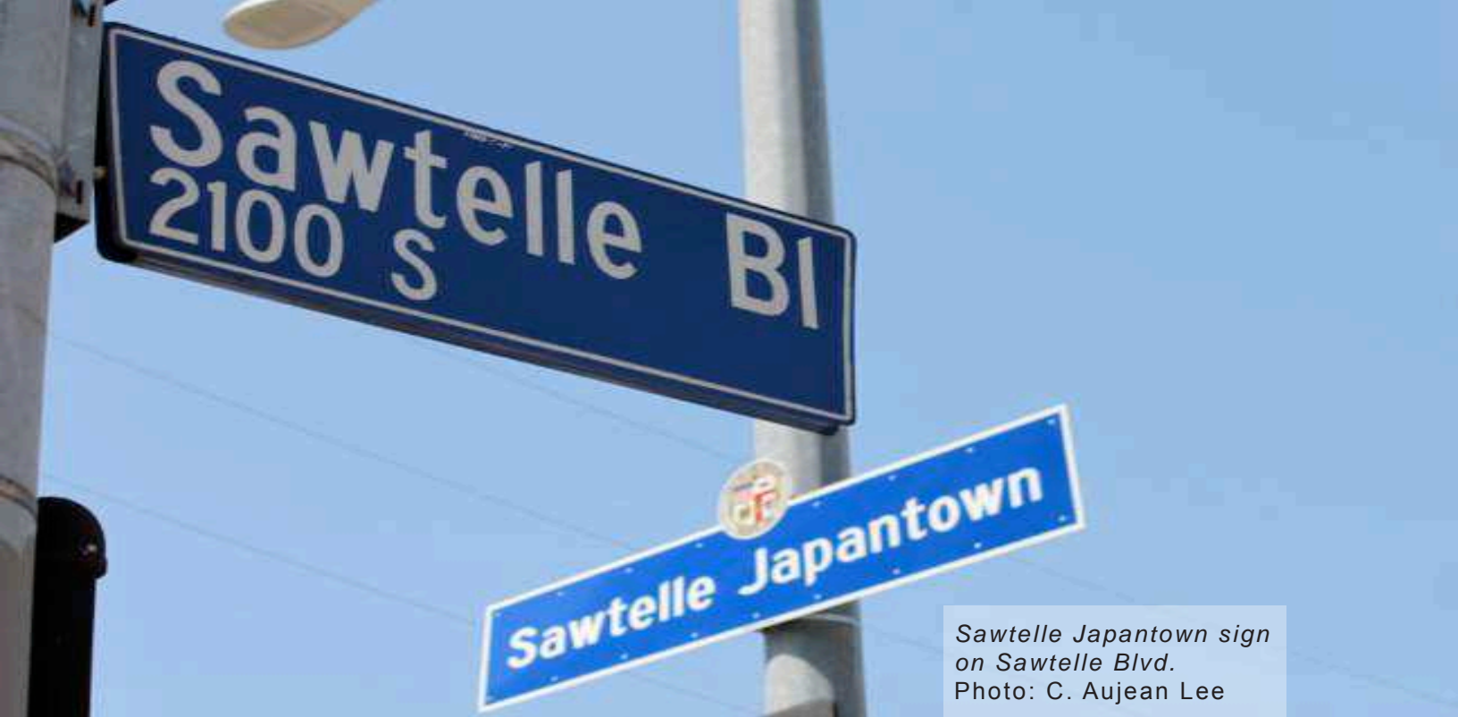
Sawtelle Japantown sign on Sawtelle Blvd.