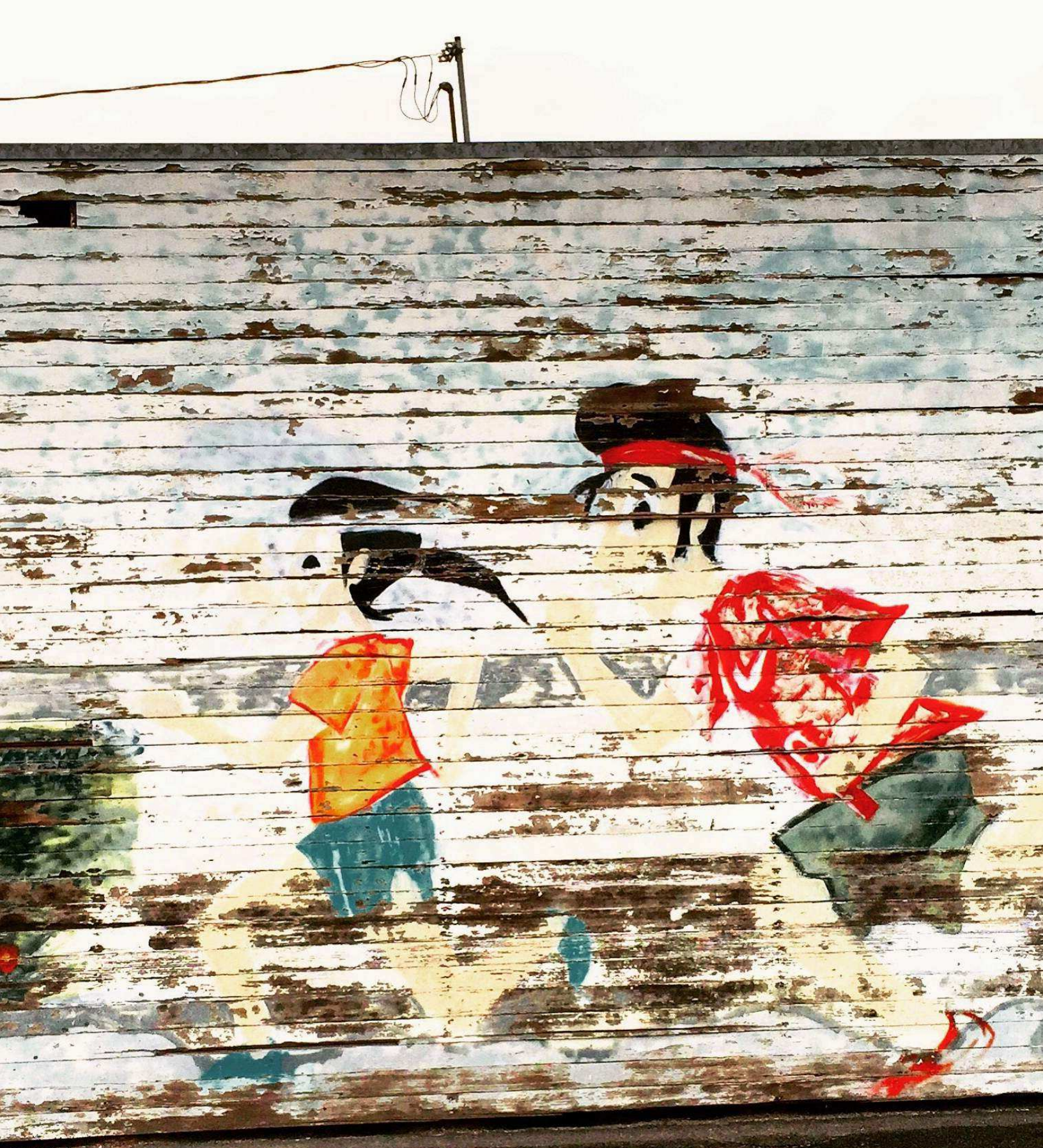
Japanese Institute of Sawtelle mural