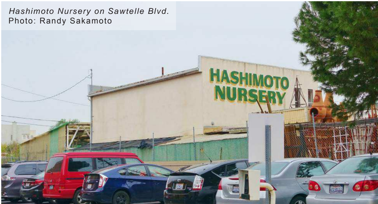
Hashimoto Nursery on Sawtelle Blvd.