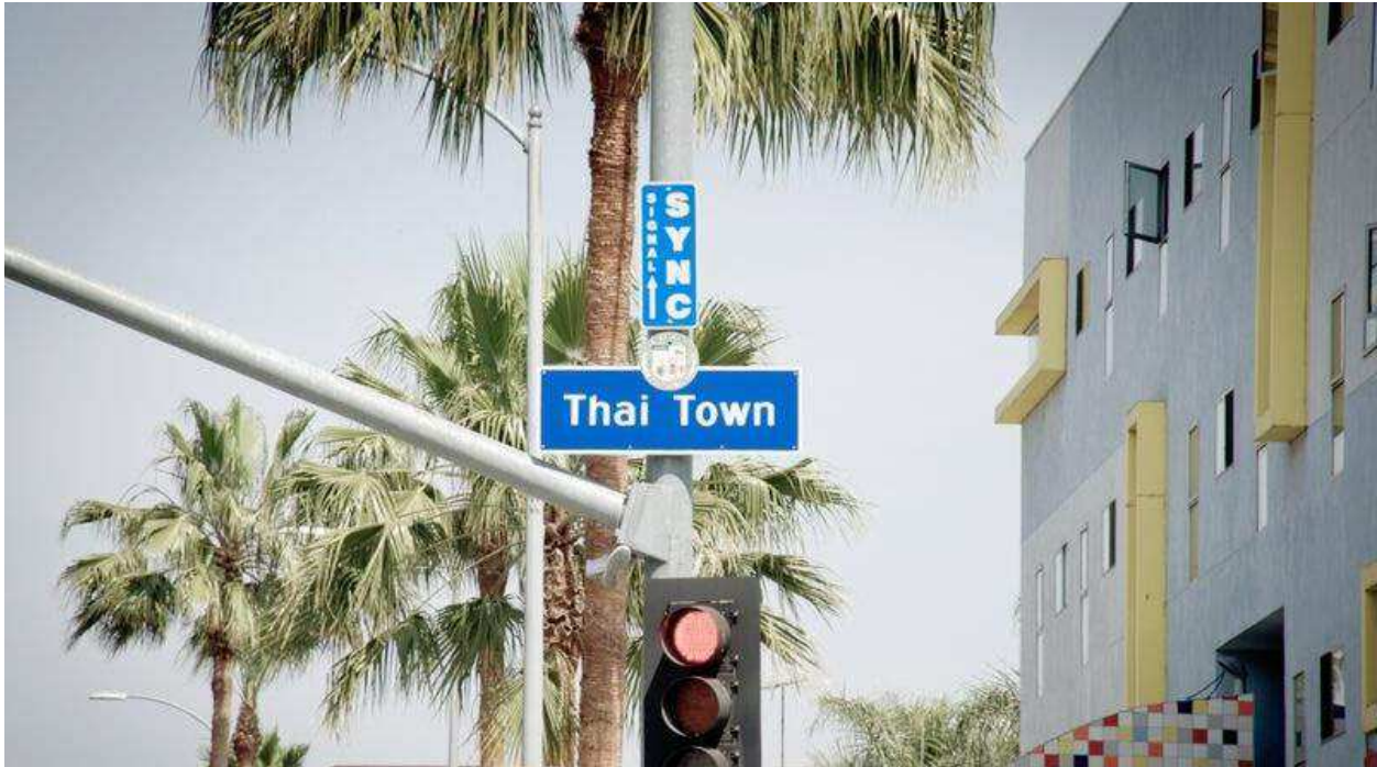
Thai Town, near Hollywood/Western Ave.